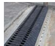
Sliding finger joints