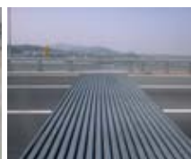
Modular expansion joints