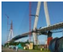
Can Tho Bridge (VN)