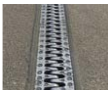
Cantilever finger joint