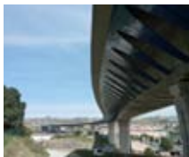
Viaducto de Trapagaran (ES)