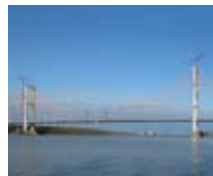
Audubon Bridge (USA)