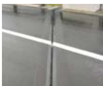
Single gap joints